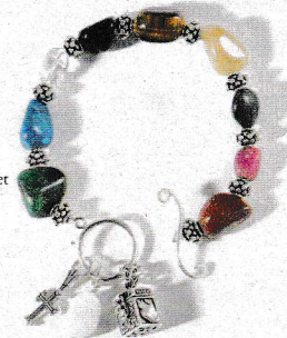
Just For Girls Psalm 23 Bracelet