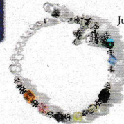
Natural Stone Psalm 23 Bracelet